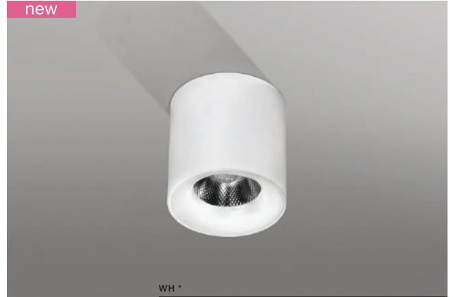
MANE 20W DIMM