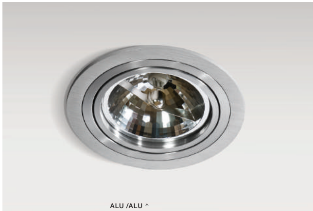
ALU /ALU *